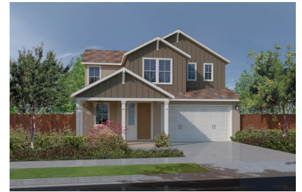
Kiper Homes 360 Lakeside

In October, Kiper Homes will open its models at 360 Lakeside, whose trailer is already on-site for preview sales.