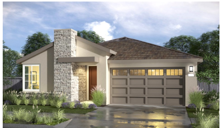
Balboa by Kiper Homes