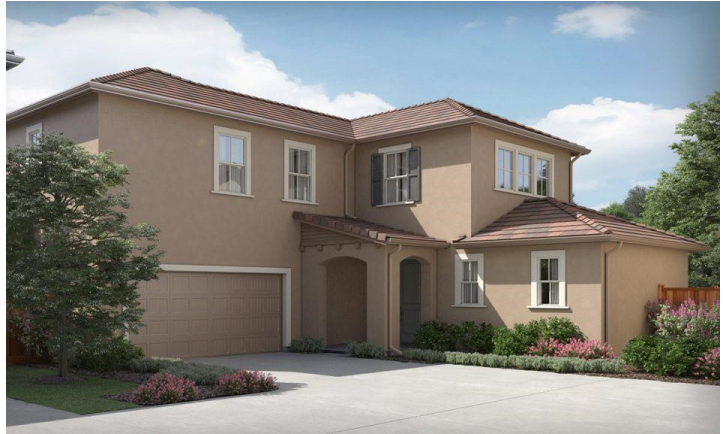
Horizon by Lennar Homes

The next project to be previewing at River Islands will be Balboa by Kiper Homes. Built on the shores of a brand-new lake, Balboa will offer three to five bedrooms from 1950 to 2750 square feet. The Kiper family approach to creating neighborhoods of lasting appeal is evident in all of the details in the architecture, designed by award-winning WHA Architects. Details and elevations will be posted on the RiverIslands.com website as soon as they are available from Kiper Homes.